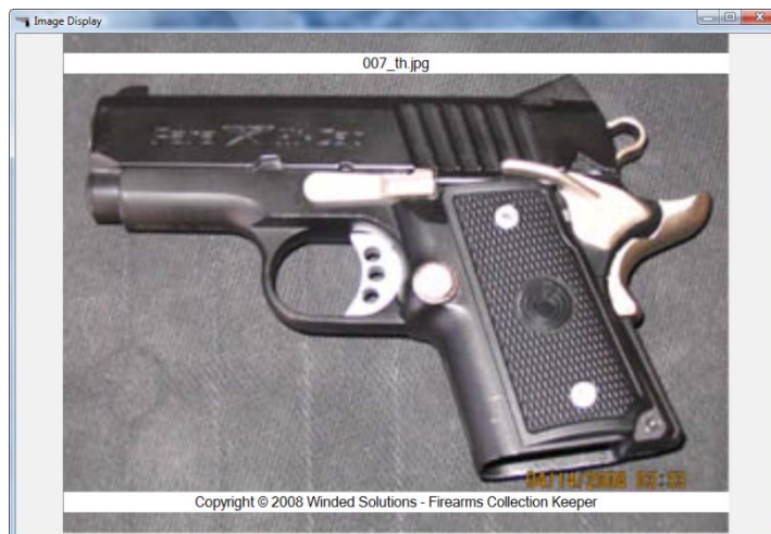
[Figure 4 – Image Full Screen]